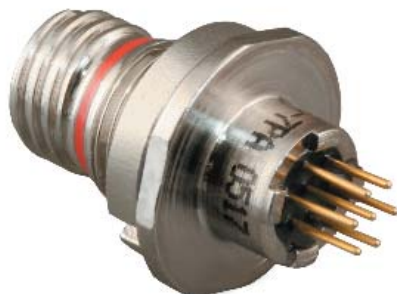
Series 801 Printed Circuit Board Receptacle

These receptacles feature a low profile shell for minimum protrusion inside enclosures. Contacts are non-removable. Connectors are backfilled with epoxy for a watertight seal.